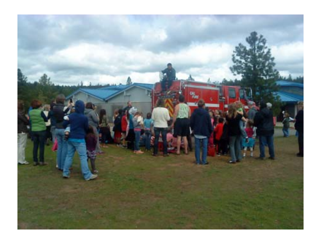
Heard Around Campus

While the day was dreary, spirits were not. Company 24 showed up with their engines and eggs were dropped amid many shouts of encouragement. A few messes were made but most seemed to survive.